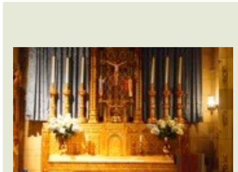
Chapel of St. Genevieve's [SSC Retreat]

While on retreat I had the time to reflect on a CNBC documentary which I recently saw. Tom Brokaw tells the story of one of the most wealthy and influential