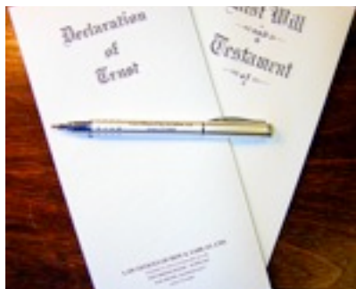
When making an Estate, give some prayerful consideration about naming St. Uriel's in your Will.

I encourage parishioners when making out their wills to consider including St. Uriel's.