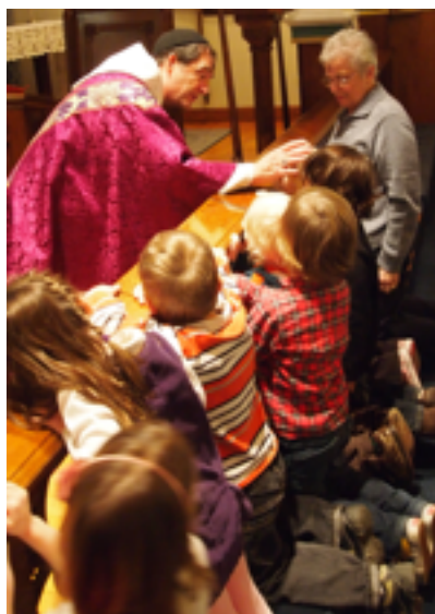
Nursery School students receiving the Ashes on Ash Wednesday 2011.