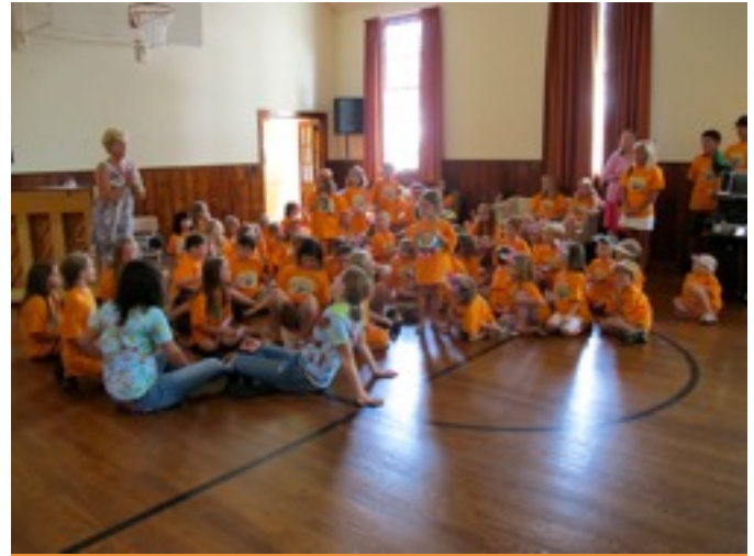
Vacation Bible School class, 2010.

net . I look forward to working with everyone and to see God's work throughout the week.