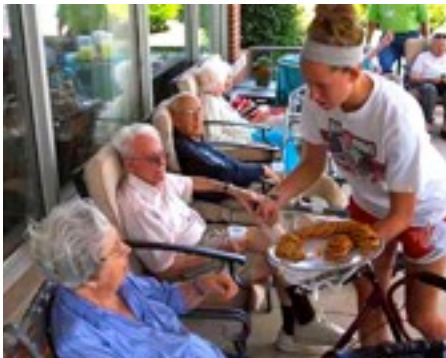
Last year's Mission Trip was "service" oriented. This year's Mission trip will be "work" group oriented.

Easter. Last week we talked about new life from eggs and what new life means in our own lives. We will be making palm crosses on Palm Sunday. The week after Easter we will be having an Easter egg hunt to continue celebrating the Easter season.